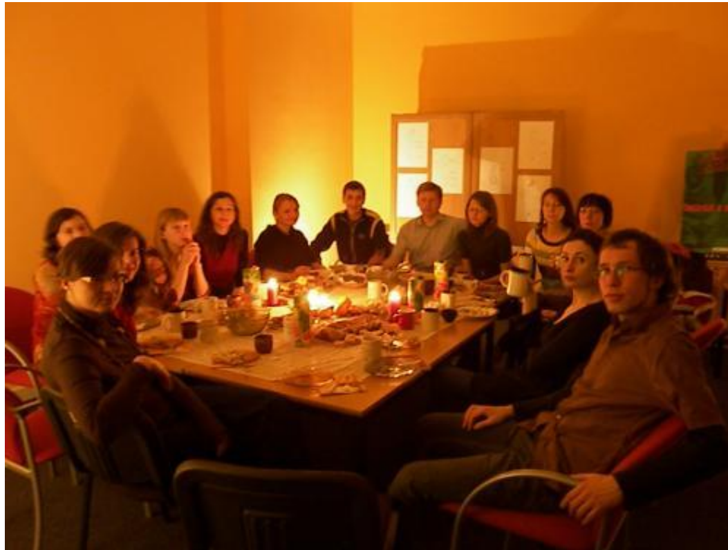
Christmas Party – Refugee.pl's premises